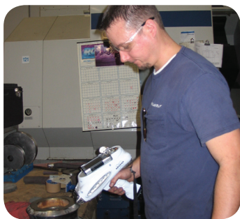
S1 TURBO SD is the ideal tool for Positive Material Identification (PMI).