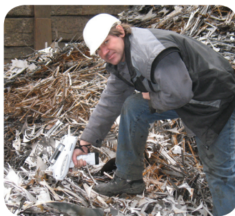
Use the S1 TURBO SD to quickly sort recycled metals including titanium and aluminum alloys.